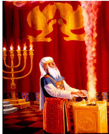
The Altar of Incense

It is almost like being there as we discuss every part, every type and view the shadows of Christ. I would like to