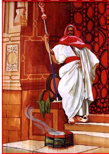
The Temple Guard

Remember, John was very knowledgeable about the Temple and was well acquainted with Temple life. It was John that opened the way for Peter to come into the courtyard of the high priest, John 18:15&16. These two verses tell us that