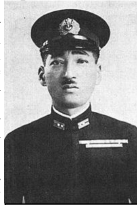
Mitsuo Fuchida in 1941

By the end of the day eight American battleships, along with other smaller ships, lay in ruin. The Arizona was scrapped for good; the Oklahoma, California and West Virginia were sunk. The Ne-