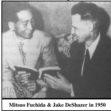
Mitsuo Fuchida & Jake DeShazer in 1950