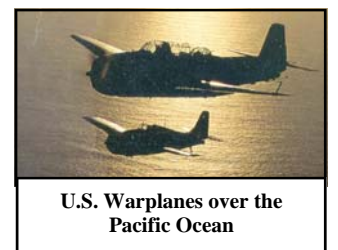
U.S. Warplanes over the Pacific Ocean

As we prepare to celebrate the birth of the