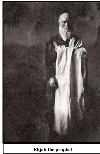
Elijah the prophet

Child of God, did you know that it is His desire for us to know spiritual fulfillment? God has designed and planned that we would enjoy this life.